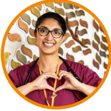
Doctor / Consultant

Here are some of the people you might meet while staying with us: